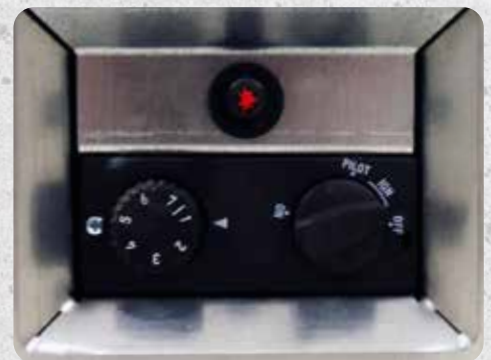
7-setting thermostatic controller with recessed controls to prevent damage