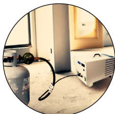
Runs on a single 20 lbs cylinder