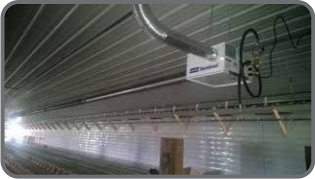
Sentinel, Ceiling Mount