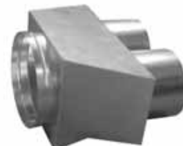
16" Duct Adapter