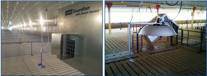
Works with a wide range of house controls that offer a 0-10 volt signal.